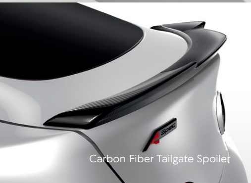
Carbon Fiber Tailgate Spoiler