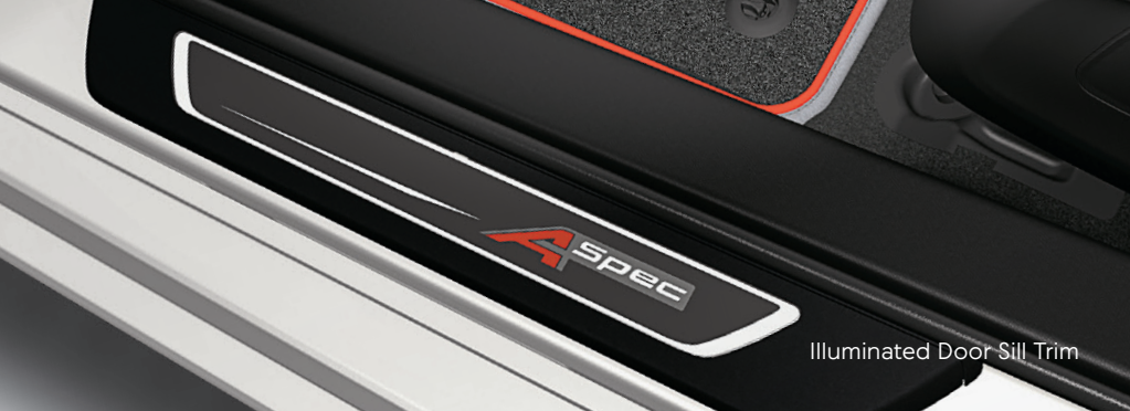
Illuminated Door Sill Trim

Make it yours with Acura Genuine Accessories