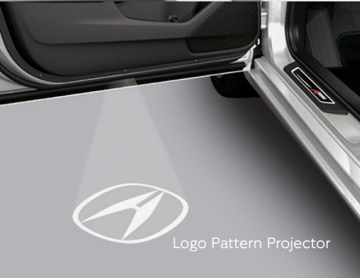
Logo Pattern Projector