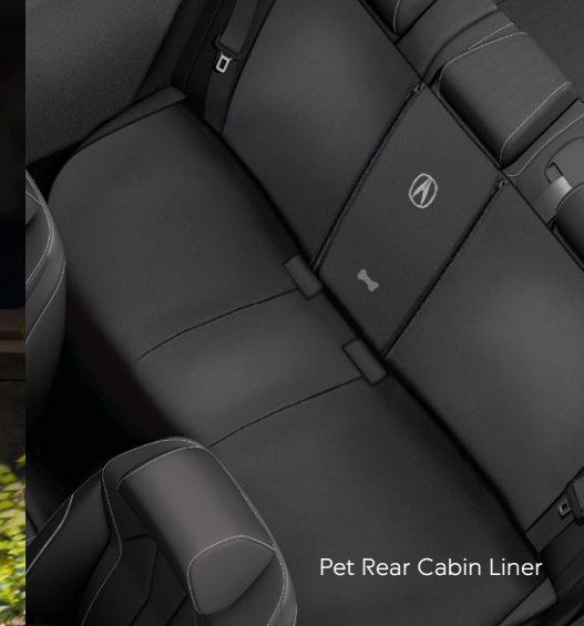
Pet Rear Cabin Liner

Integra A-SPEC Tech shown in Liquid Carbon Metallic with Carbon Fiber Door Mirror Covers, Carbon Fiber Tailgate Spoiler, Gloss Black Emblems, Illuminated Front A-Mark Emblem, Rear Diffuser, Side Underbody Spoiler, and 19-in Matte Black Alloy Wheels with Black Wheel Locks. Some components and colors may vary. Please see your Acura dealer for details.