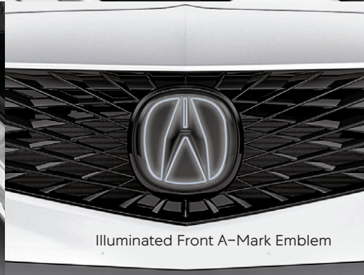
Illuminated Front A-Mark Emblem