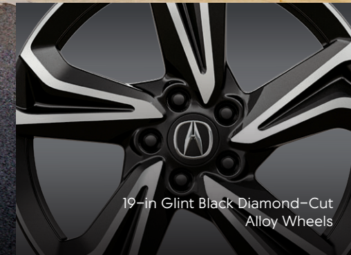
19-in Glint Black Diamond-Cut Alloy Wheels