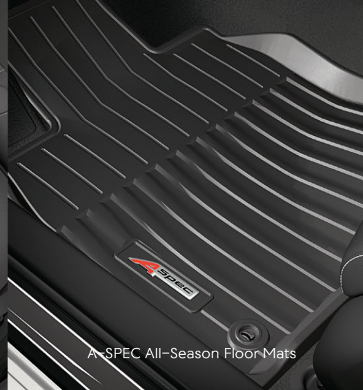
A-SPEC All-Season Floor Mats