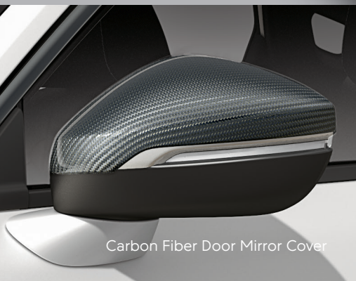
Carbon Fiber Door Mirror Cover